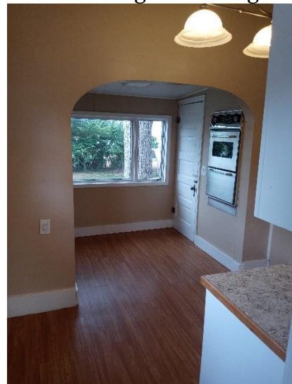
The view out the kitchen window to the