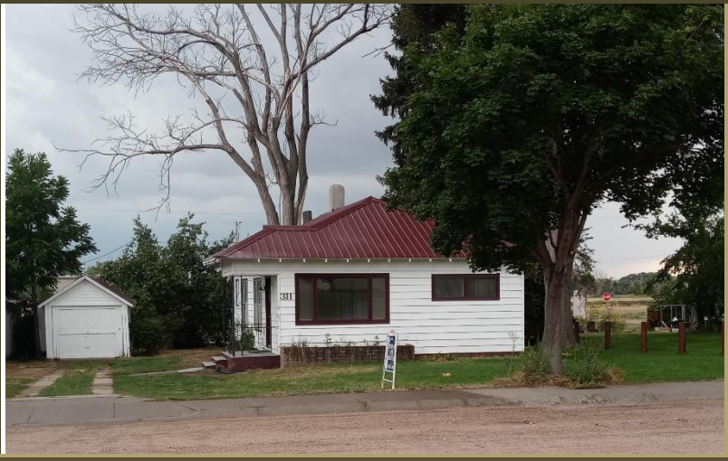
311 Bates Blvd, Lodgepole, NE