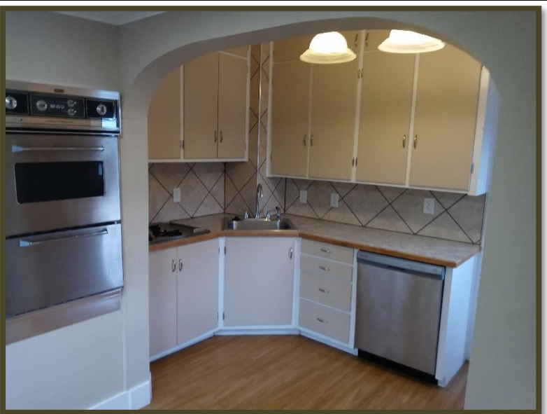
The kitchen with wall oven, gas cooktop, wood flooring and dining area.