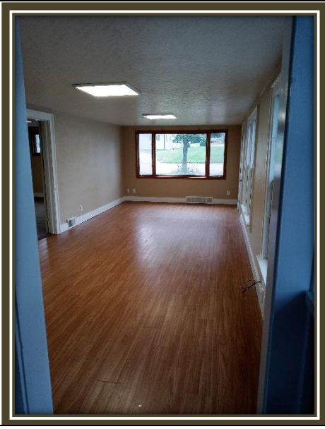
The refinished living room with wood flooring, recessed lighting